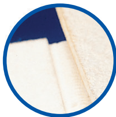
Heatset for stability