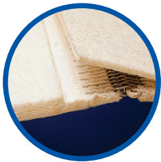
100% heavyweight fiber construction