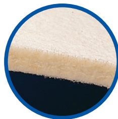
4-layer woven base fabric needed side for improved finish