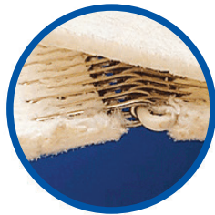
Mechanically and chemically interlocked fiber and base